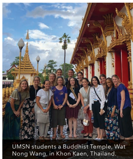
UMSN students at a Buddhist Temple, Wat Nong Wang, in Khon Kaen, Thailand.