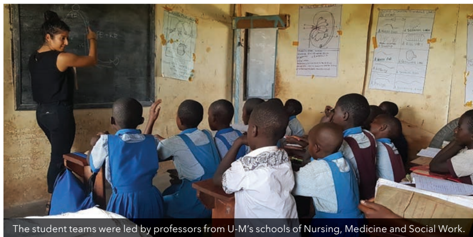
The student teams were led by professors from U-M's schools of Nursing, Medicine and Social Work.

One of those places is in Uganda at Mbarara University of Science and Technology (MUST), where the U-M Medical School's Global