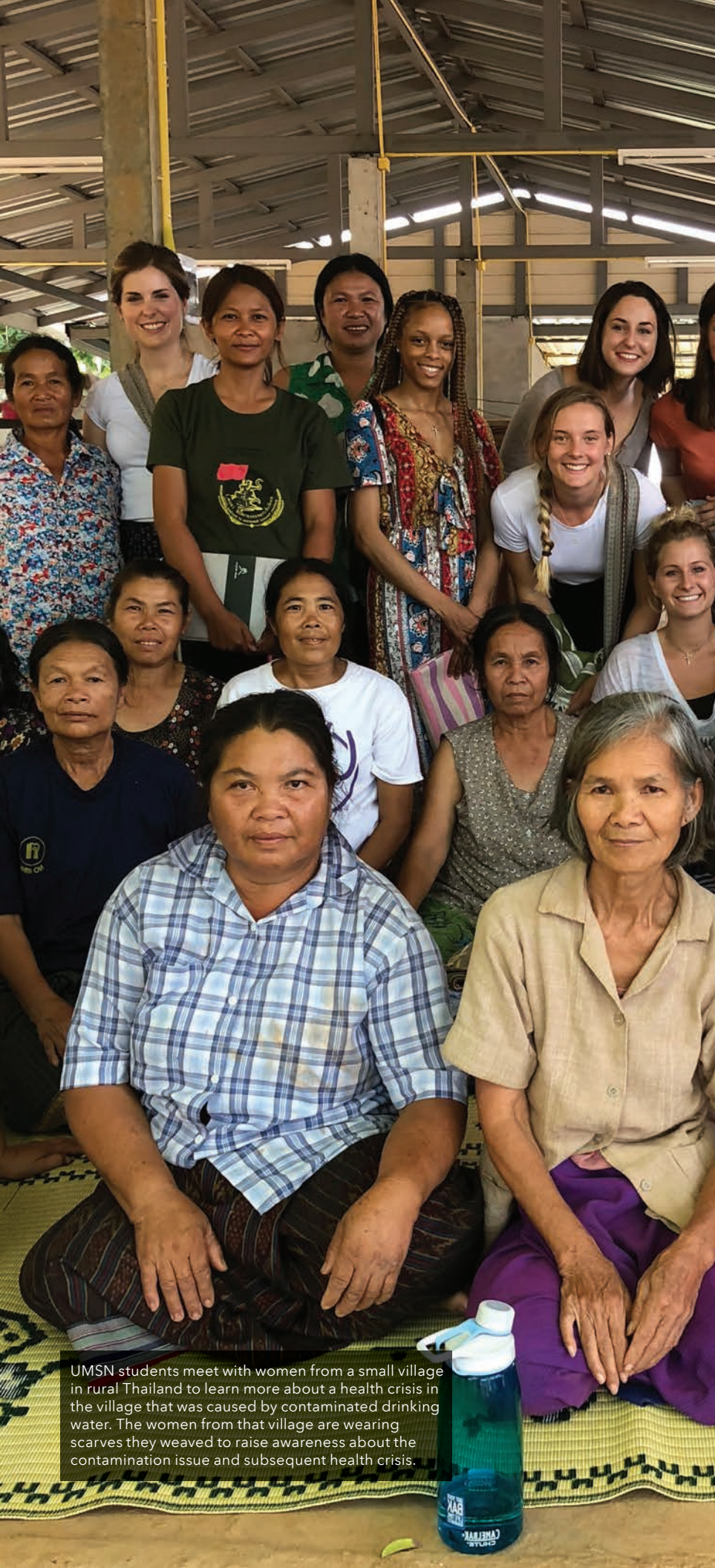
UMSN students meet with women from a small village in rural Thailand to learn more about a health crisis in the village that was caused by contaminated drinking water. The women from that village are wearing scarves they weaved to raise awareness about the contamination issue and subsequent health crisis.