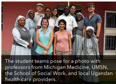
The student teams pose for a photo with professors from Michigan Medicine, UMSN, the School of Social Work, and local Ugandan health care providers.

While last summer's initial experience laid the groundwork and helped establish relationships, future plans call for additional student groups to return to Uganda in the spring of 2019 to embed with MUST students in their own ongoing community projects. ■