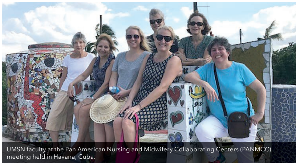
UMSN faculty at the Pan American Nursing and Midwifery Collaborating Centers (PANMCC) meeting held in Havana, Cuba.