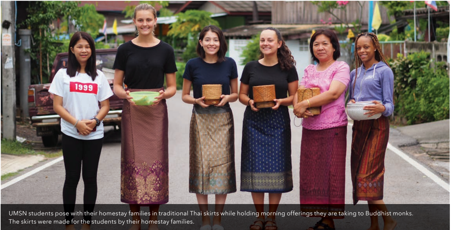
UMSN students pose with their homestay families in traditional Thai skirts while holding morning offerings they are taking to Buddhist monks. The skirts were made for the students by their homestay families.