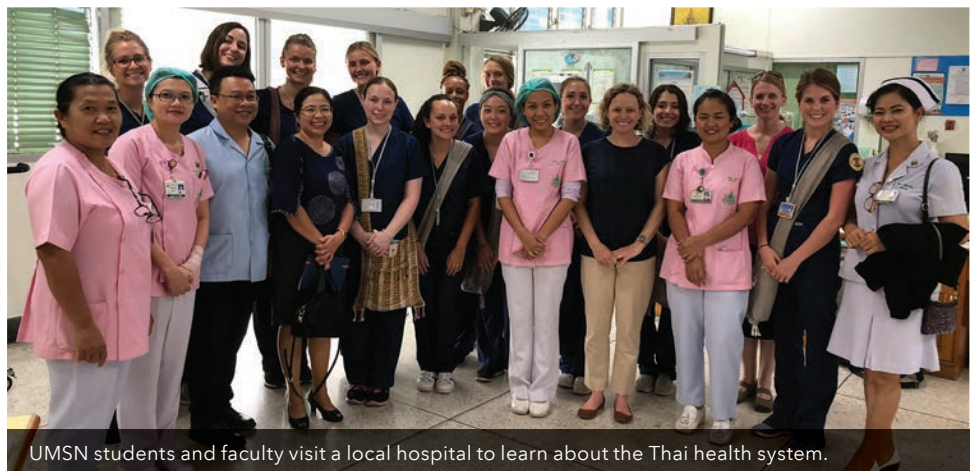
UMSN students and faculty visit a local hospital to learn about the Thai health system.

“In Thailand public hospitals are funded by the king and queen,” she explained. “If you donate to the king and queen—and to the sick—and volunteer to help the sick, then you won’t get sick. It’s motivation for the public to help others and volunteer to make others’ lives better so your life stays good. I thought America could really learn from that.”