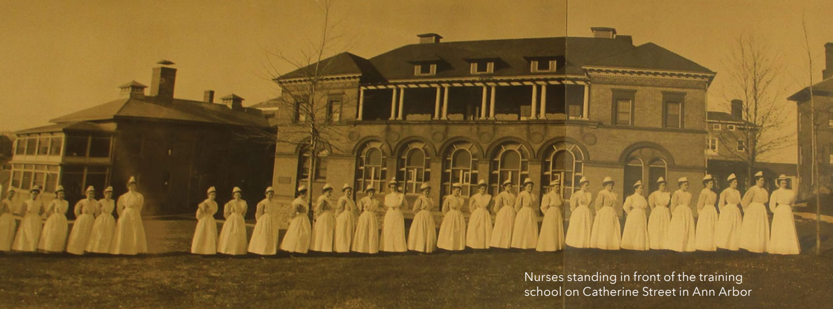
Nurses standing in front of the training school on Catherine Street in Ann Arbor