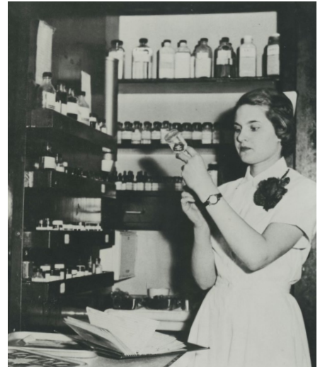
1958 Nursing senior preparing medication.