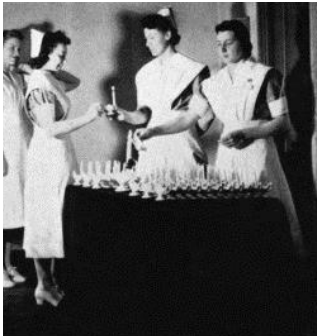
1943 Capping ceremonies were held to mark the end of the nursing students' probationary period. The ceremony was considered a highly meaningful transition into the nursing profession.