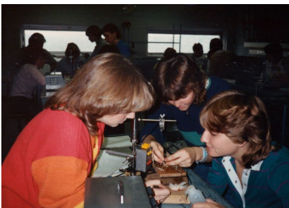
1985 Nursing students conduct an experiment in their physiology lab. The experiment focused on muscles and the strength of their contractions.