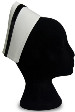
Late 1960s Nursing cap.