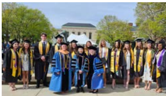
Proud Rho graduates gathered in front of Ingalls fountain just before the SN commencement ceremony