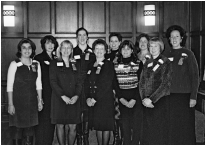
Graduate Student Rho Chapter 2002 Inductees