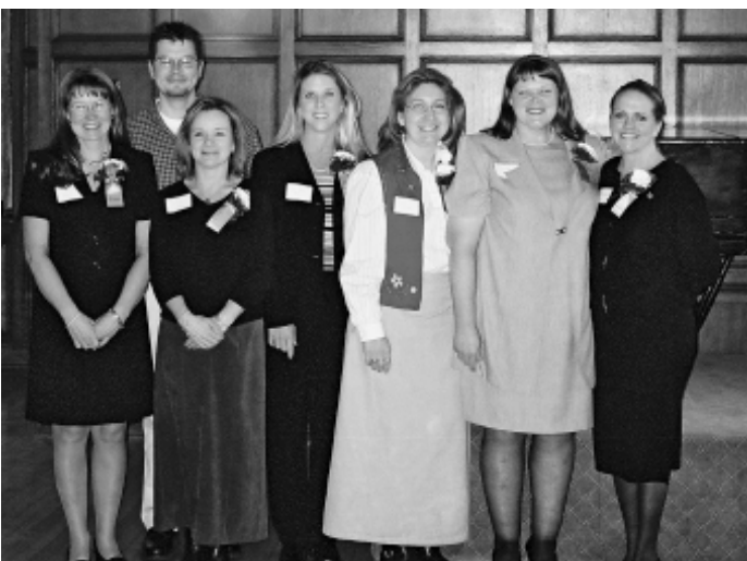
RN-BSN Student Chapter 2002 Inductees