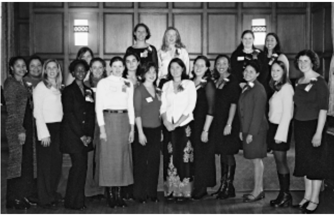
Senior Student Rho Chapter 2002 Inductees