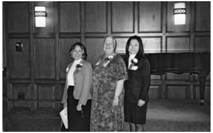
Community Member 2002 Inductees