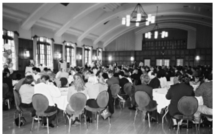
Audience attending 2002 Induction