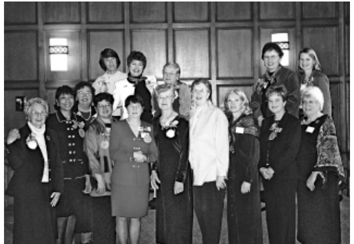
"Silver" members attending ceremony