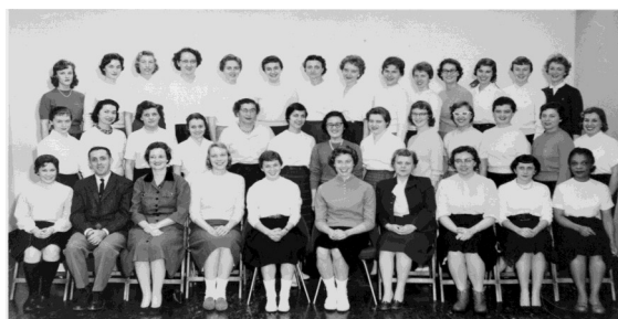
Founding Members of Rho Chapter, 1960