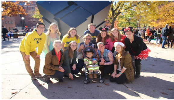
Nursing School team with their Dance Marathon Family at the Pumpkin Carving event in October