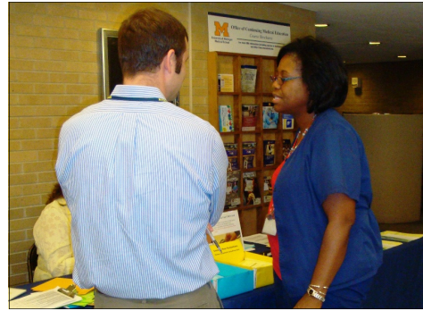
Poster session viewing