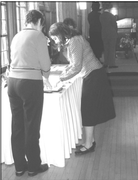
New inductees sign the Rho Membership Book.