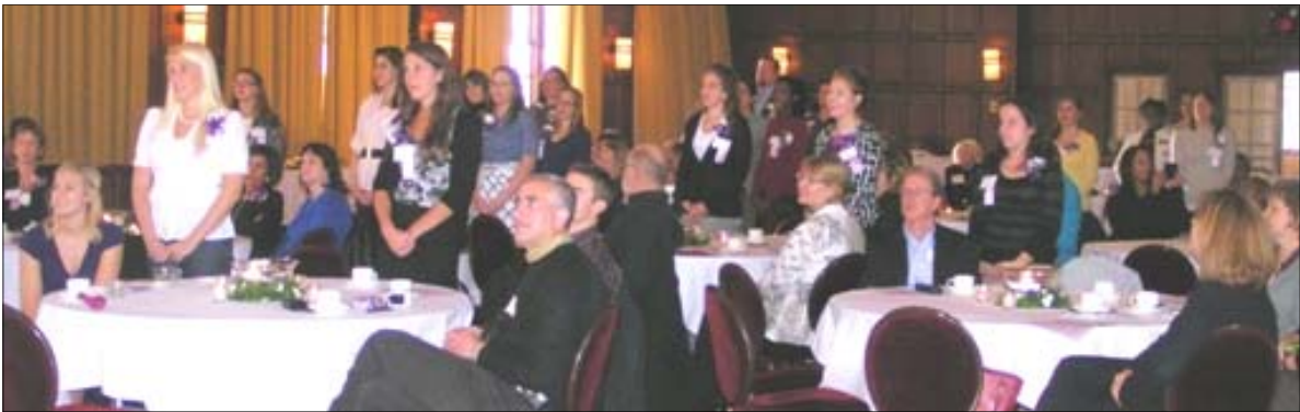
New members recite the membership pledge