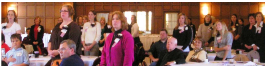
New members recite the membership pledge