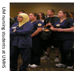
UM nursing students at UMHS